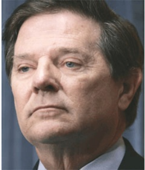
What Tom Delay did in Texas is perfectly legal in Oregon.

When it comes to campaign finance reform, Oregon is last, dead last! Oregon is one of only 5 states with NO LIMITS on political campaign contributions for any state or local race. None!